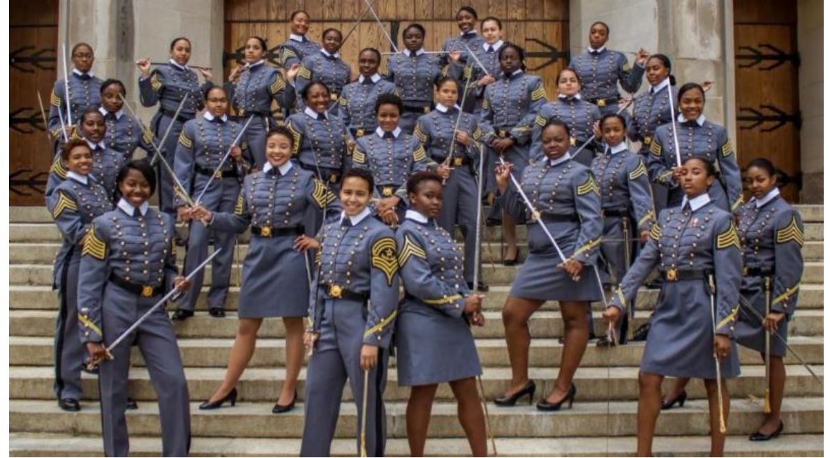
West Point's 2019 graduating class will include the most African-American female cadets in the school's history.

Thirty-four African American women are expected to graduate from West Point at the end of this month -- the <u>highest number of black women</u> to graduate in the same class in the military academy's 217-year history.