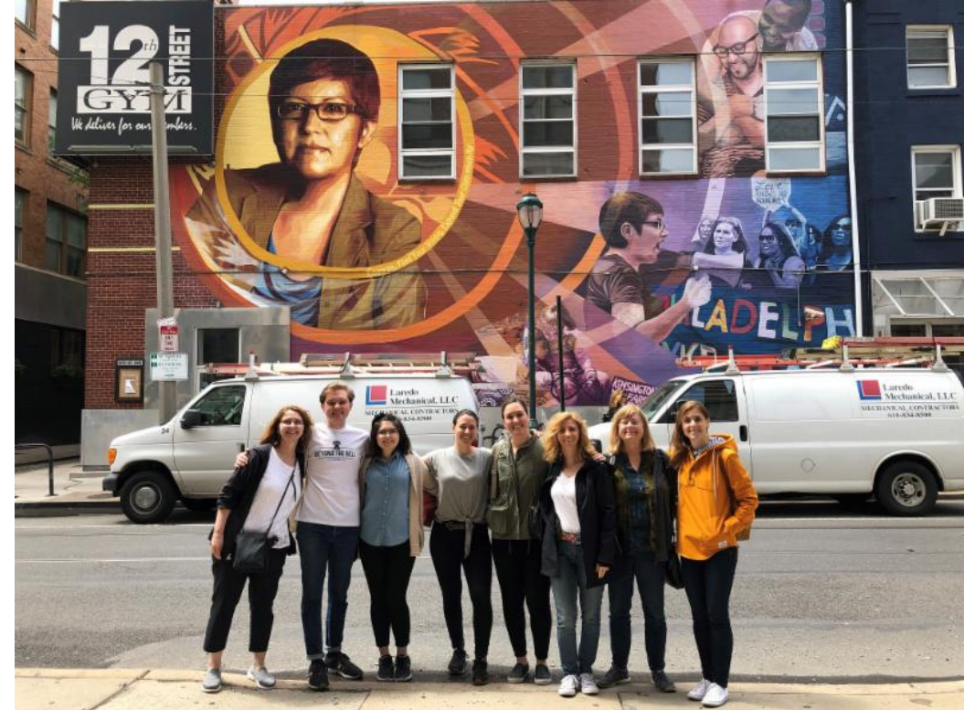
Members of the Vision 2020 team joined Women 100 Proud Partner Beyond the Bell for its "Badass Women of Philadelphia" tour.

Members of the Vision 2020 team recently participated in <u>Women 100 Proud Partner</u> Beyond the Bell Tours' <u>Badass Women of Philadelphia</u> tour, a refreshing take on real women trailblazers often overlooked in the traditional telling of U.S. history.